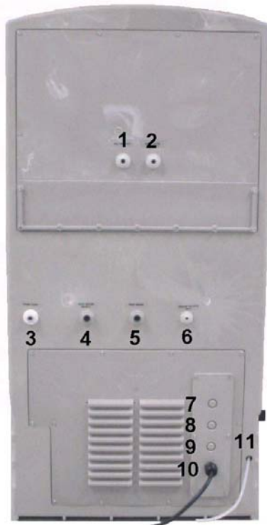
EXTERIOR – REAR VIEW