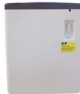
External brine tank